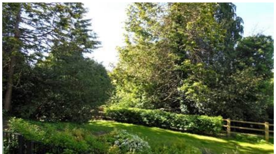
'Resident fox, waiting to be fed'(left)