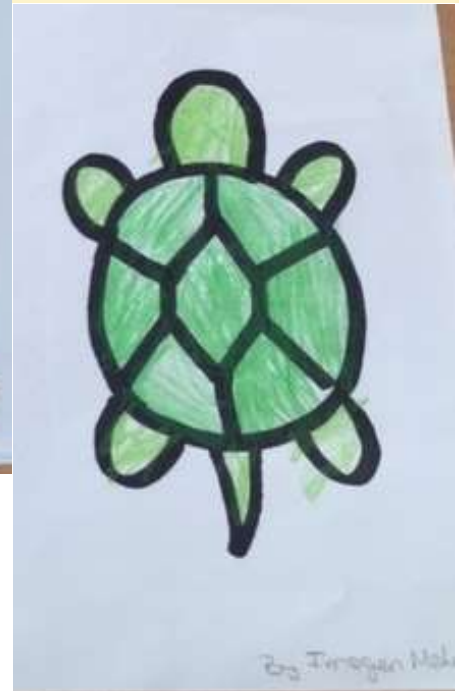
Drawings by Imogen and Olivia