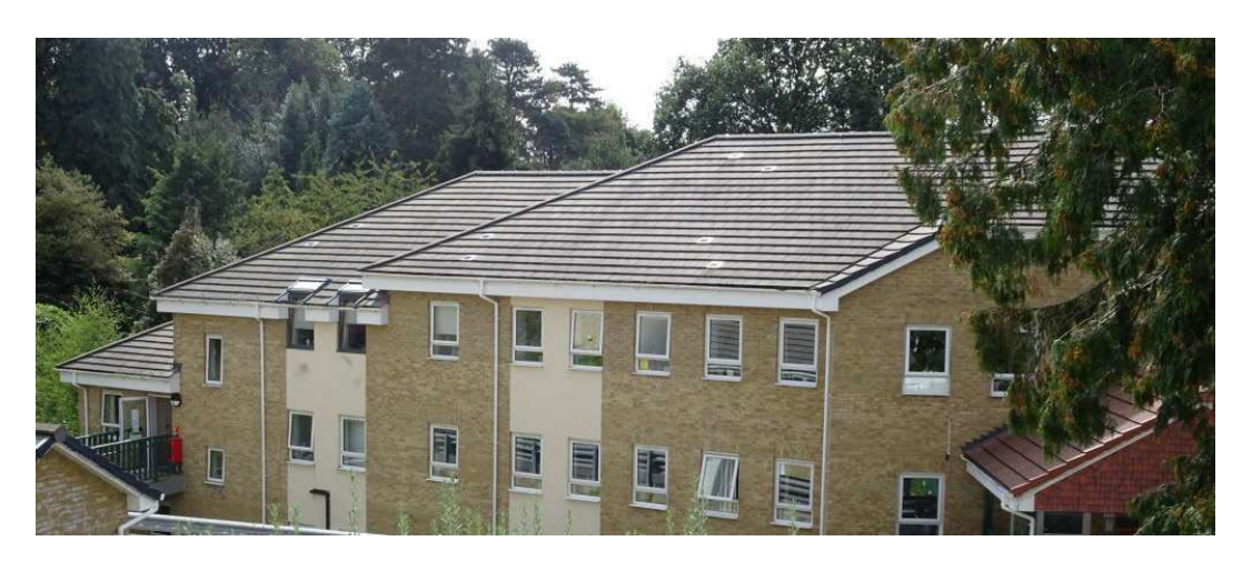
How Rockdale is organised

Rockdale Housing Association is registered under the Industrial and Provident Societies' Act on charitable model rules. It is also registered with the Homes and Communities Agency as a registered social landlord and is a member of the National Housing Federation.